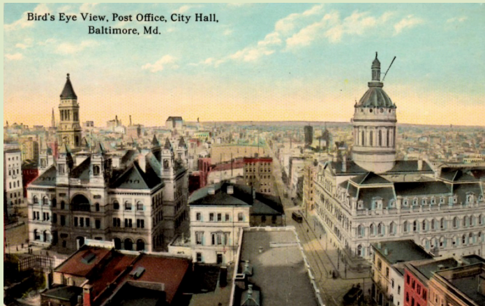
Bird's Eye View, Post Office, City Hall, Baltimore, Md.

Did you know?! The first post office system in the United States was inaugurated in Baltimore in 1774.