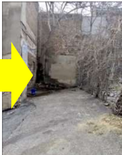
Above and Below. Some of the many "before and after" images captured during the March clean up.