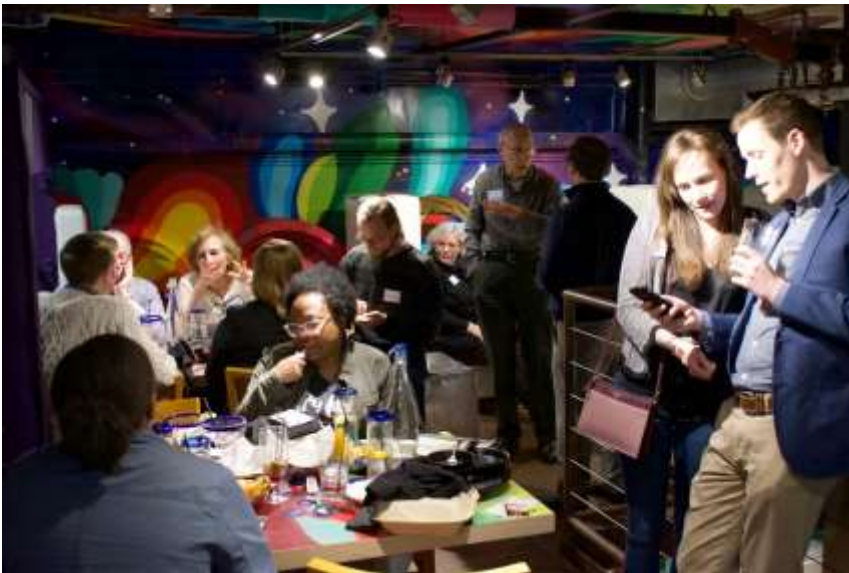
Above. City Center residents enjoy light bites and conversation at R&R's colorfully outfitted mezzanine dining area.