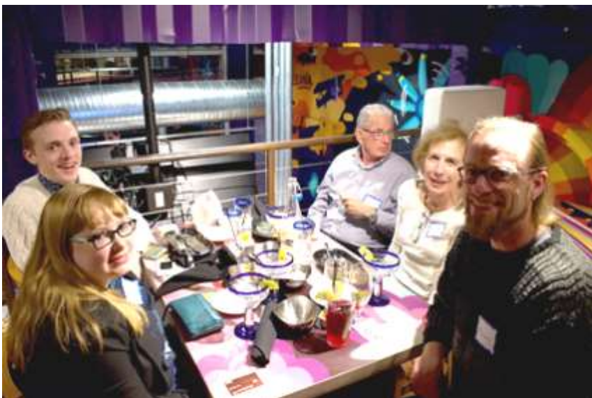
Below. City Center residents pose for a picture while enjoying drinks and conversation at the March 28th gathering.