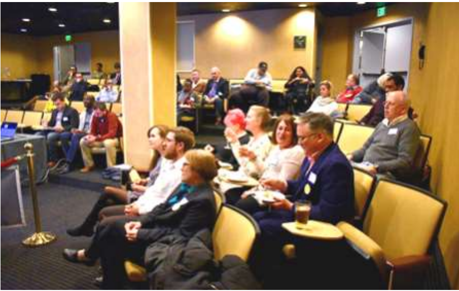
Above. City Center residents and community partners gather at the Lord Baltimore Hotel on December 12, 2018 to celebrate the CCRA's first Annual Meeting.