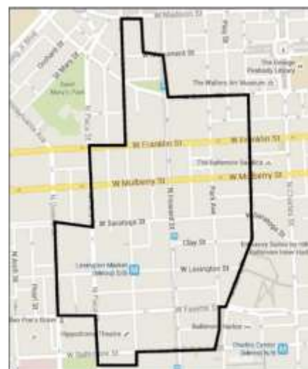
Market Center, Baltimore's Historic Retail Core

Our Retail & Development Committee will be rolling out a project of its own this month—a comprehensive survey looking at how City Center residents view and interact with the parks and open spaces in our neighborhood. The survey is being done in collaboration with the Waterfront Partnership, Center Plaza Foundation, and others. Stay tuned for the release!