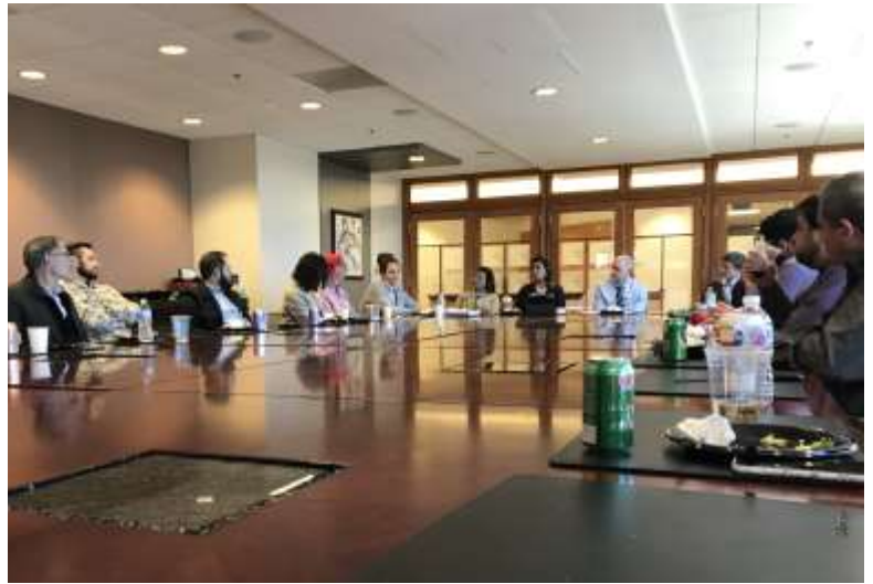
Above. Visitors from Philadelphia meet with transit leaders to discuss the impact of Lime, Bird (and now others!) scooters in Baltimore.

(Continued from cover) On April 1, 2019, a delegation of state and local government officials from Philadelphia, and members of the greater Philly business and non-profit communities, visited Baltimore to learn more about the e-scooters that descended on our city last year. Baltimore is considered something of a trailblazer on account of its active response to the scooter “drop”—working with Bird and Lime to launch a pilot program, releasing a survey to gather perspectives on the scooters, and now crafting a system of regulations that will hopefully pave the way for safe enjoyment of these new gadgets for years to come.